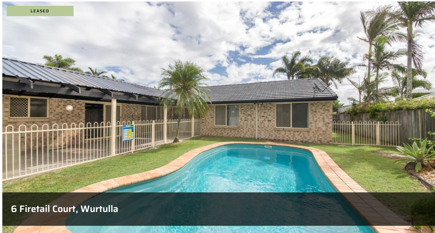
6 Firetail Court, Wurtulla