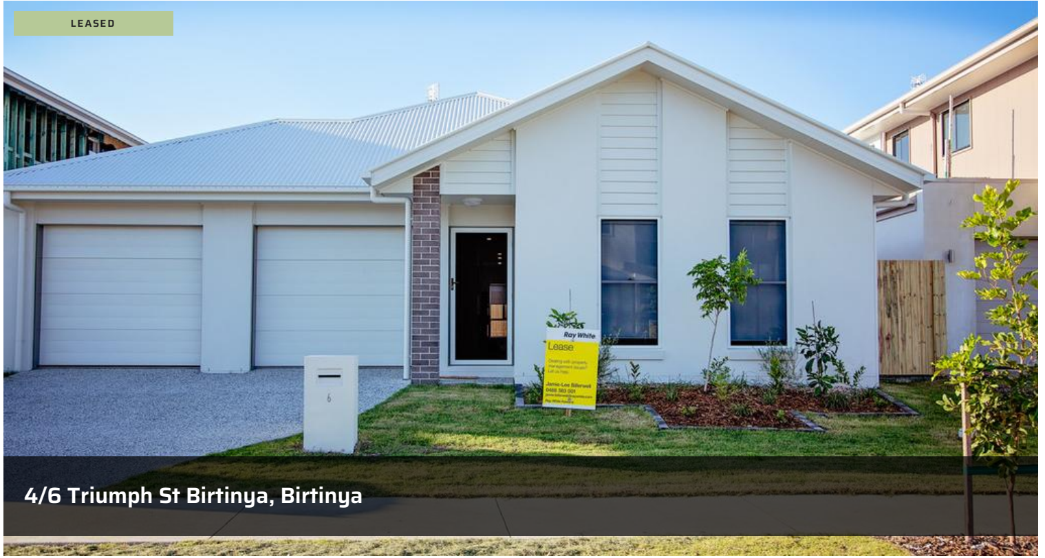
4/6 Triumph St Birtinya, Birtinya