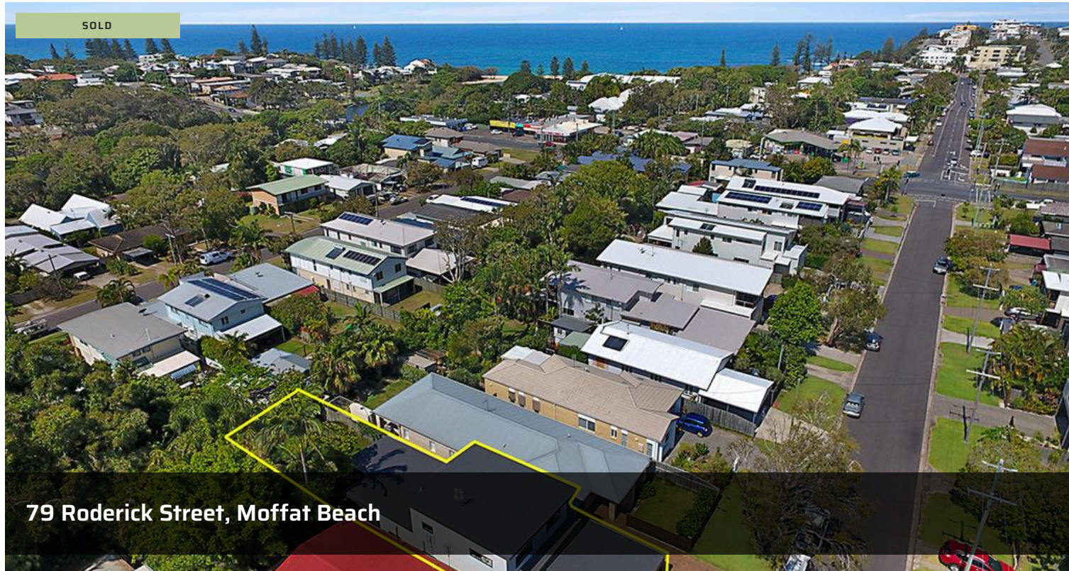
79 Roderick Street, Moffat Beach