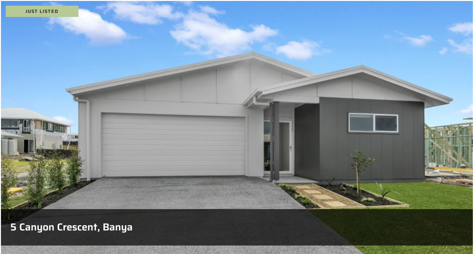
5 Canyon Crescent, Banya