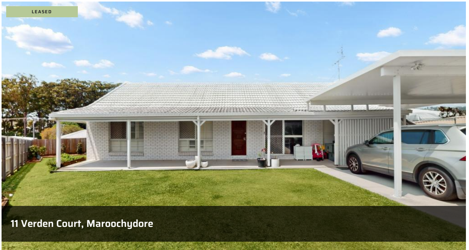
11 Verden Court, Maroochydore