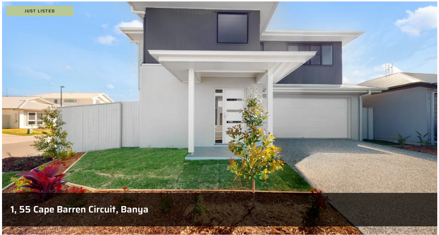
1, 55 Cape Barren Circuit, Banya