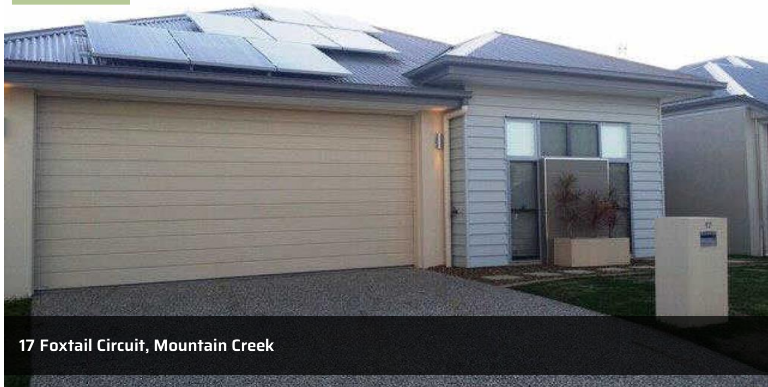
17 Foxtail Circuit, Mountain Creek