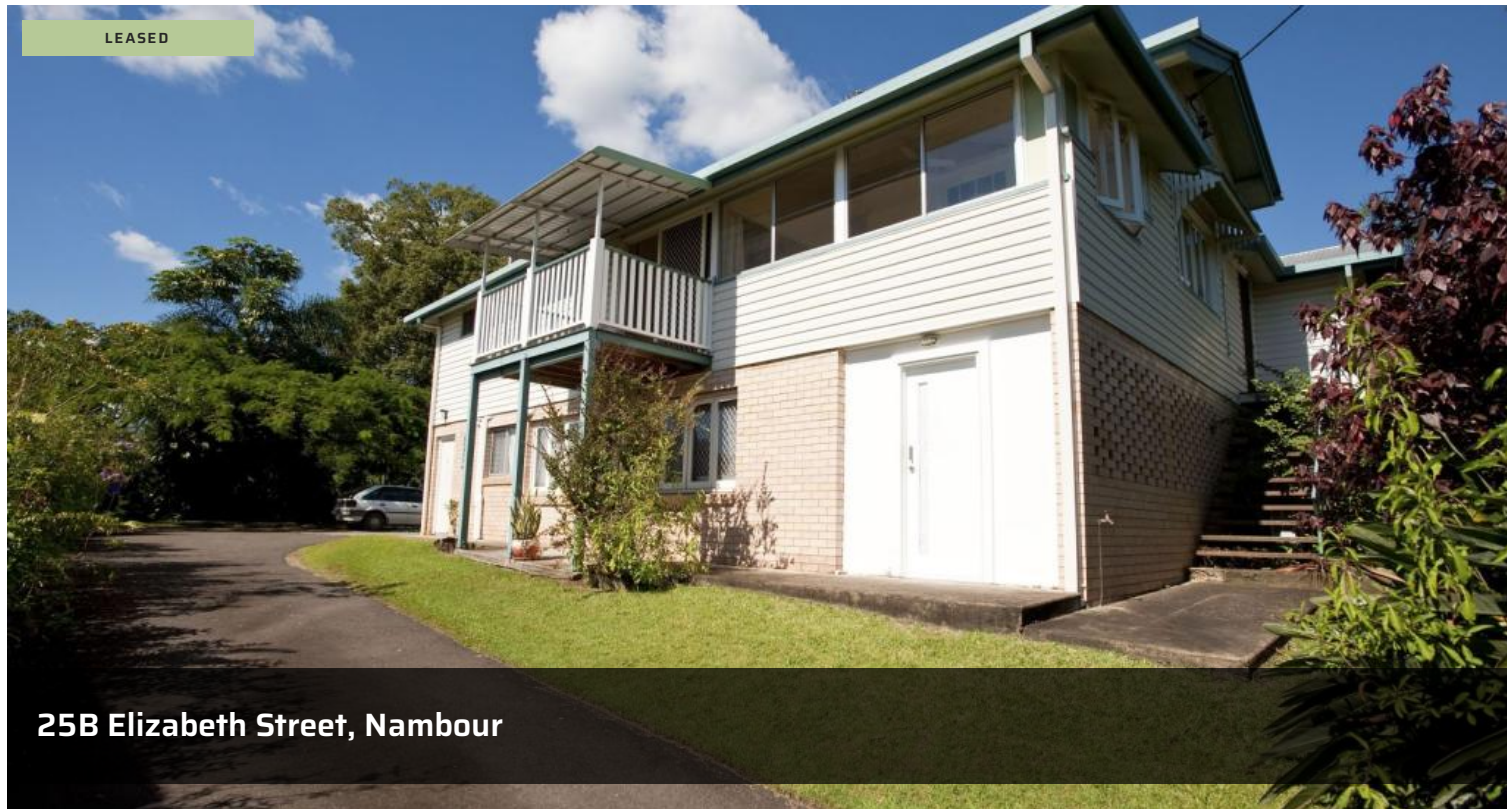
25B Elizabeth Street, Nambour