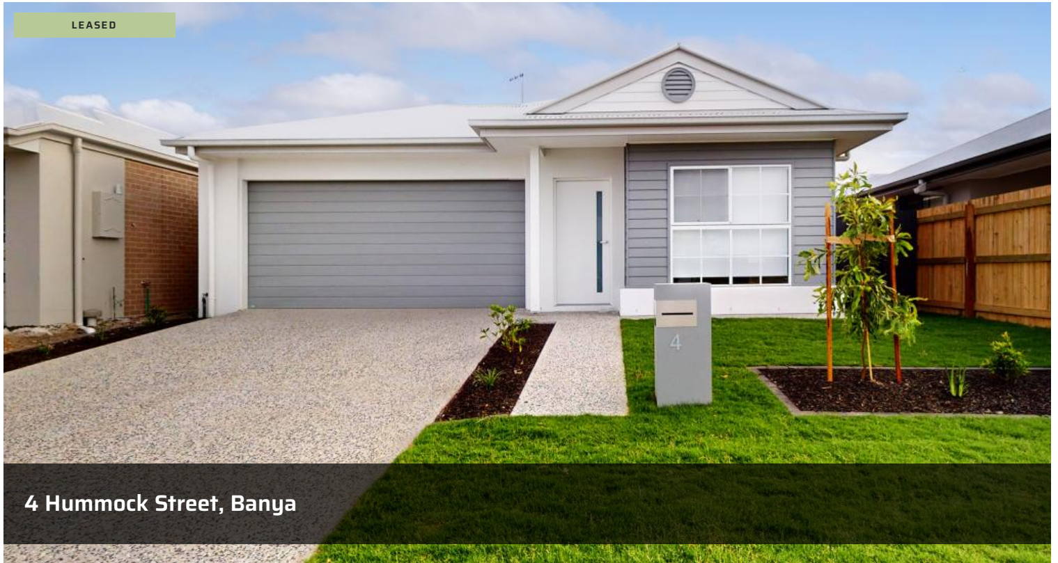
4 Hummock Street, Banya