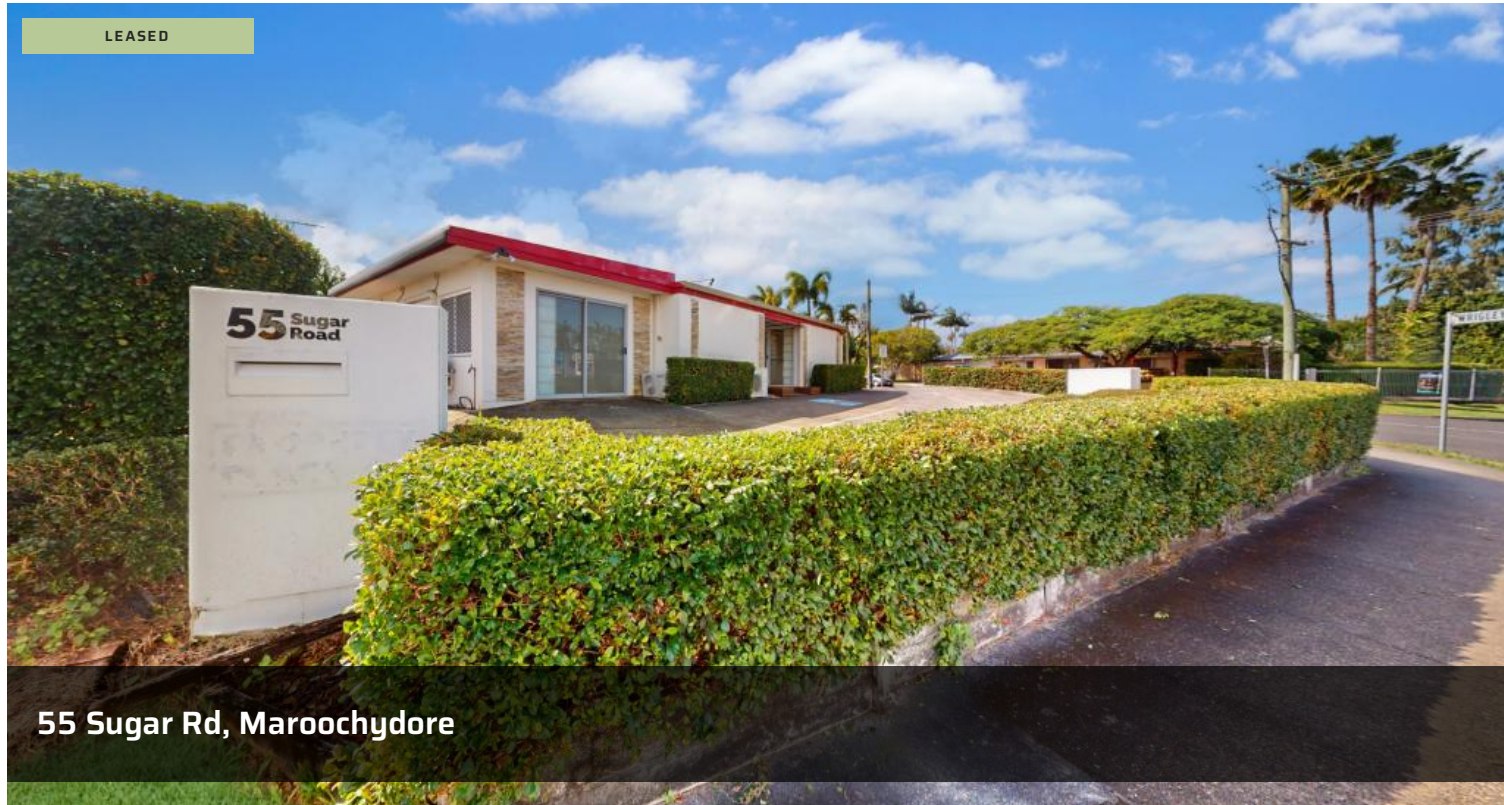
55 Sugar Rd, Maroochydore