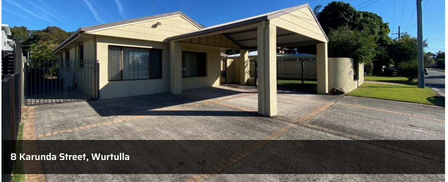
8 Karunda Street, Wurtulla