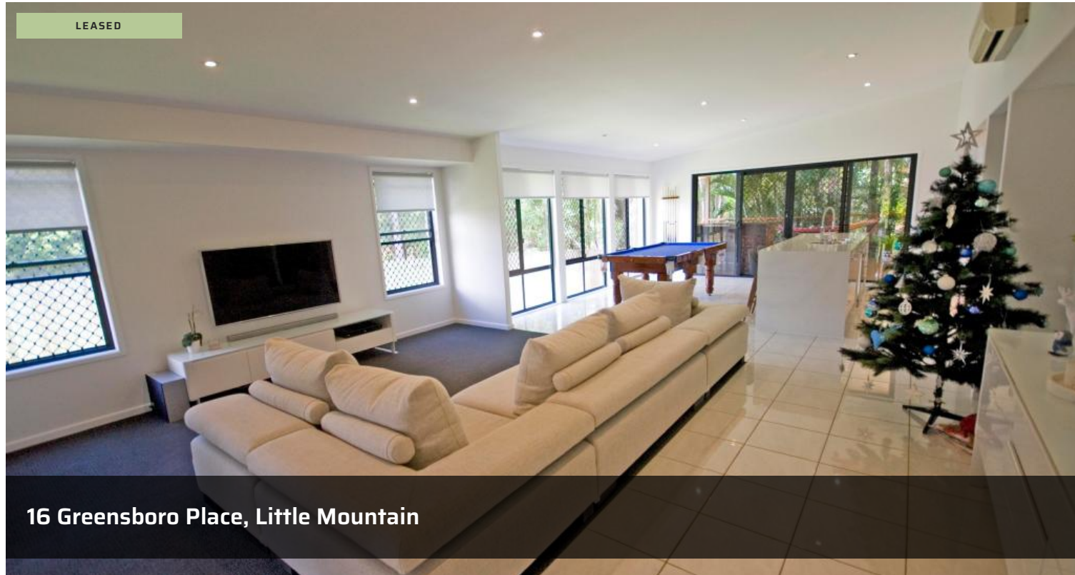
16 Greensboro Place, Little Mountain