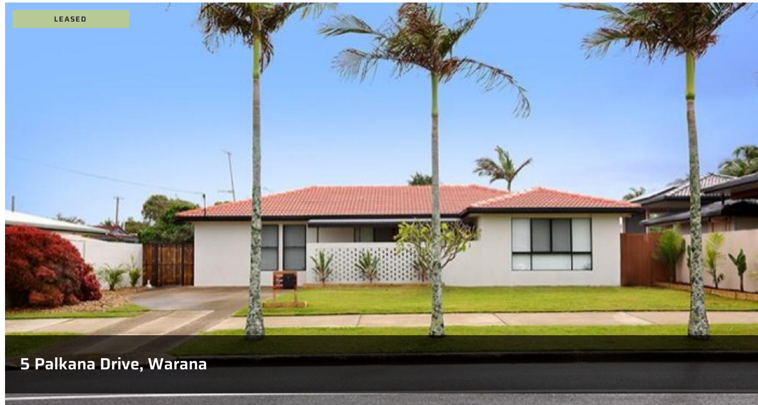
5 Palkana Drive, Warana