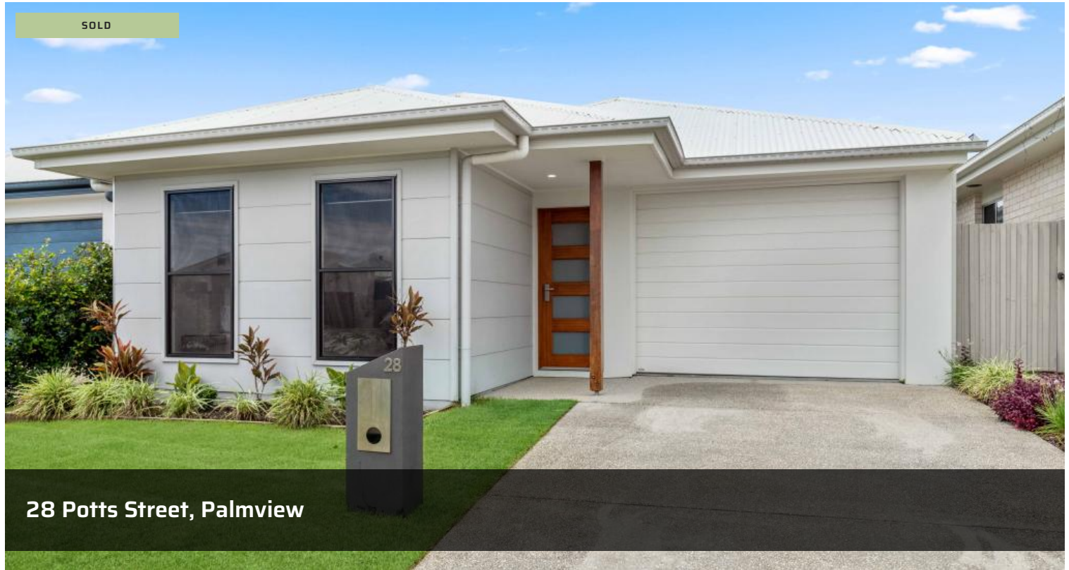
28 Potts Street, Palmview