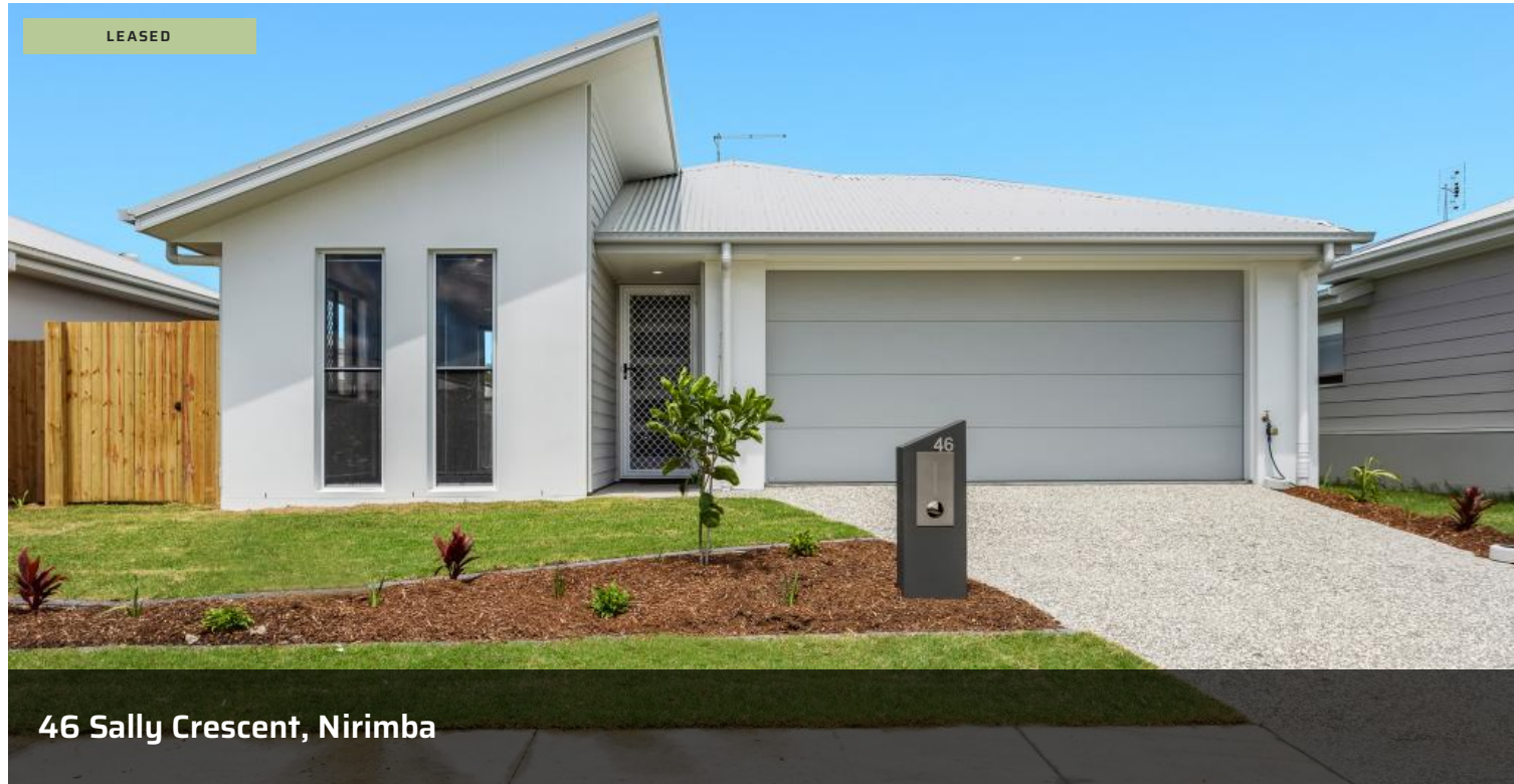
46 Sally Crescent, Nirimba