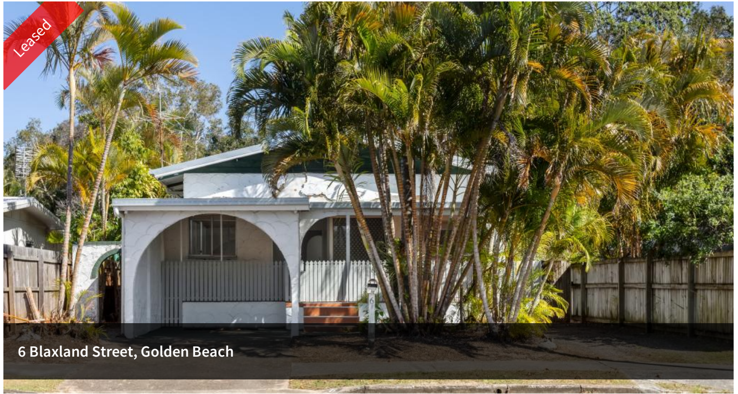
6 Blaxland Street, Golden Beach