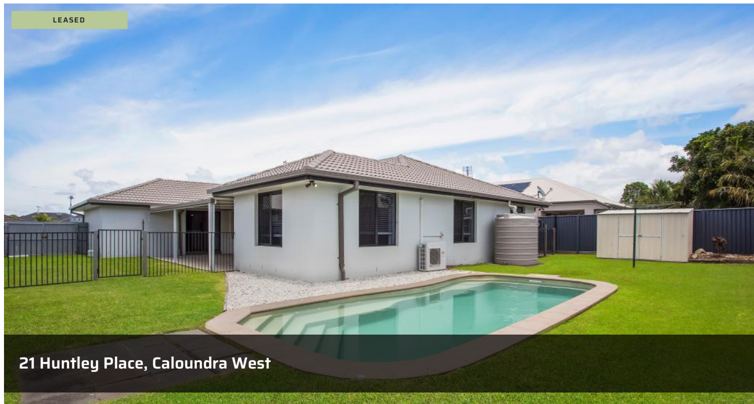
21 Huntley Place, Caloundra West