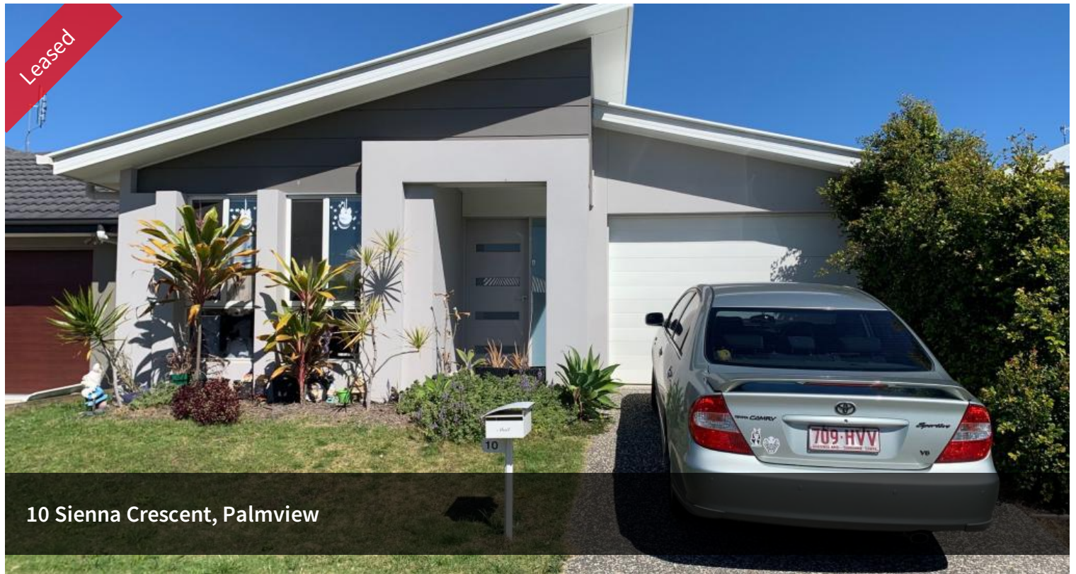
10 Sienna Crescent, Palmview