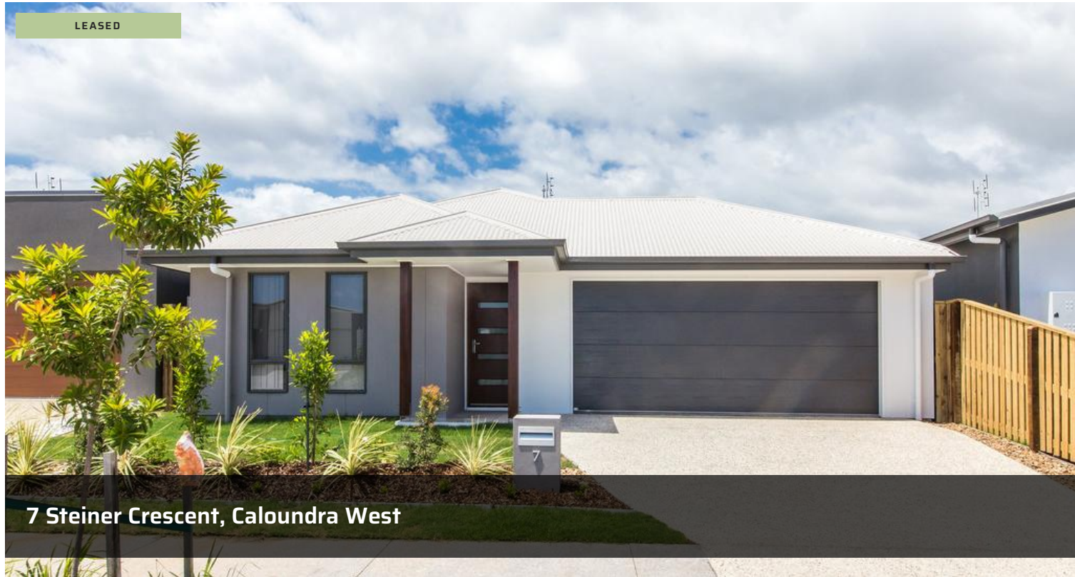
7 Steiner Crescent, Caloundra West